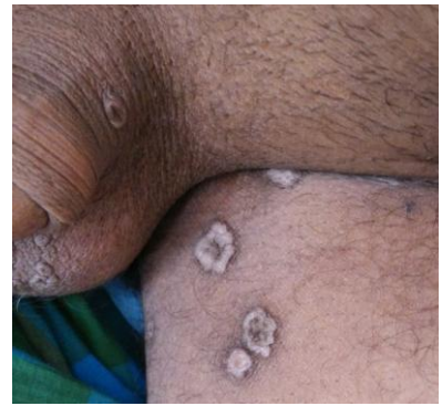
Figure 1: Hyperpigmented annular plaques of varying sizes on adjacent thigh and penile shaft

To come arrive at the final diagnosis, a tissue specimen was taken from the keratotic ridge of the scrotal lesion with 3 mm punch and sent for histopathological evaluation.